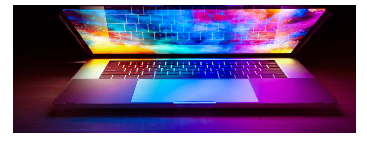
Do you know what your children are doing online?