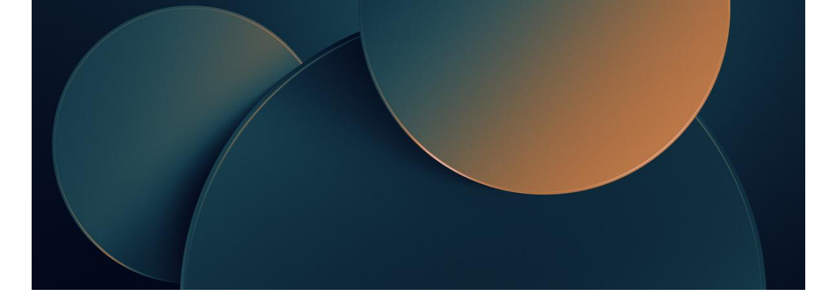
Kelly Sports Holiday Program